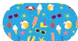
Child Motif - Beach