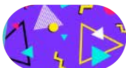
Retro Party Eclipse