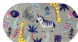
Child Motif - Giraffes & Zebras