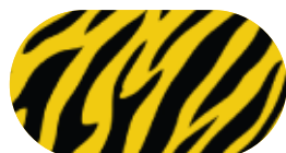
Yellow Zebra Eclipse