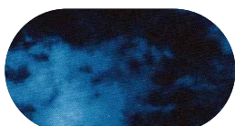
Blue Storm Eclipse