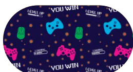
Child Motif - Gamer