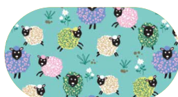
Child Motif - Sheep