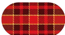
Red Tartan Eclipse