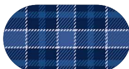
Blue Tartan Eclipse