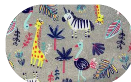
Child Motif (Subject to change)