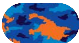
Blue/Orange Camo Eclipse