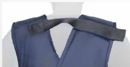
Closure A – Velcro flap between the shoulders