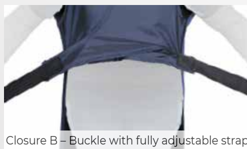
Closure B – Buckle with fully adjustable strap